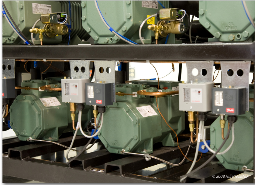
CO 2 Compressors on the SNLTX 2 Cascade System

But Price Chopper was looking for further innovations in its efforts to reduce energy consumption. In fact, says Martin, Price Chopper specified several innovations including “high-efficiency ECM fan motors and LED lighting in all cases, the use of reach-in door cases for all new medium-temperature loads, and variable-speed fan control for the air-cooled condensers. That quest for innovation is what ultimately led them to use our next generation SNLTX 2 low temperature refrigeration system.”